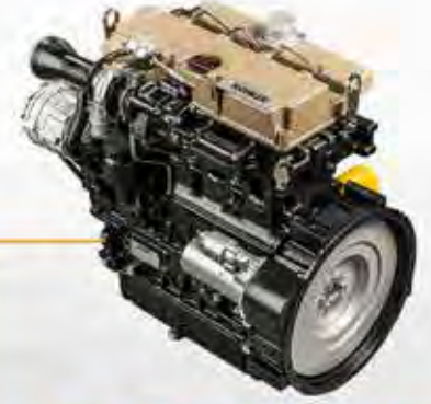
KDI 2504 TM